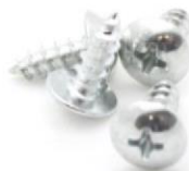
(4) Wood Screws