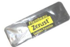
(1) Zerst Strip "Rust Protection Technology"